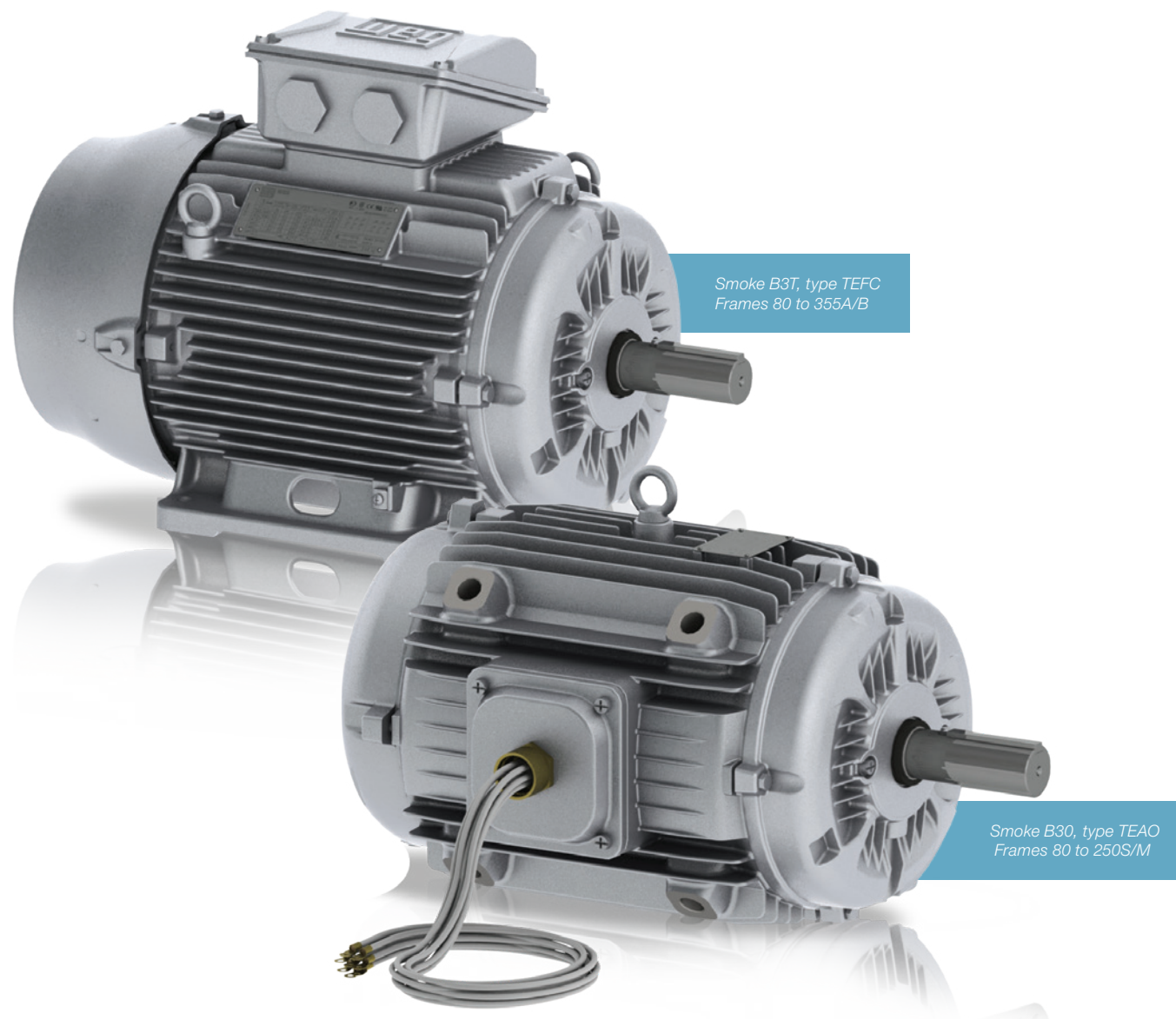
Smoke B3T, type TEFC Frames 80 to 355A/B

The Smoke Extraction motors were developed so as to ensure the air circulation in closed environments. In emergency situations, they withstand operation at high temperatures and ensure fast smoke extraction and heat, besides delaying the fire propagation, allowing free access to the emergency exits.